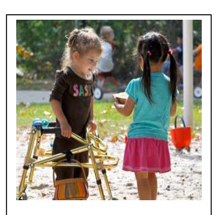
The Individuals with Disabilities Education Act (IDEA) "...presumes that the first placement option considered for a preschool child with a disability is the regular public preschool program the child would attend if the child did not have a disability" (OSEP Dear Colleague Letter, January 2017).

quality services and supports for young children with disabilities and their families that are a complement to the NAEYC Developmentally Appropriate Practices for all young children. The DEC