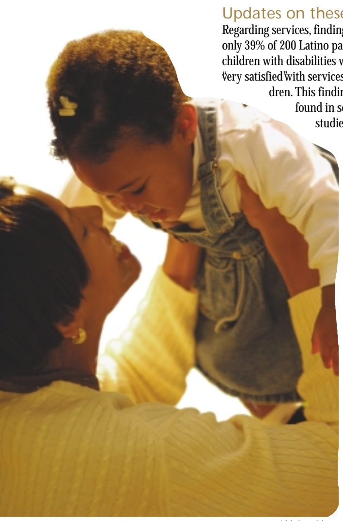
Adobe Image Library