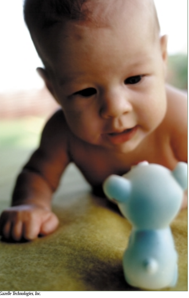
Gazelle Technologies, Inc

From the parents' perspective, it is when these changes begin taking