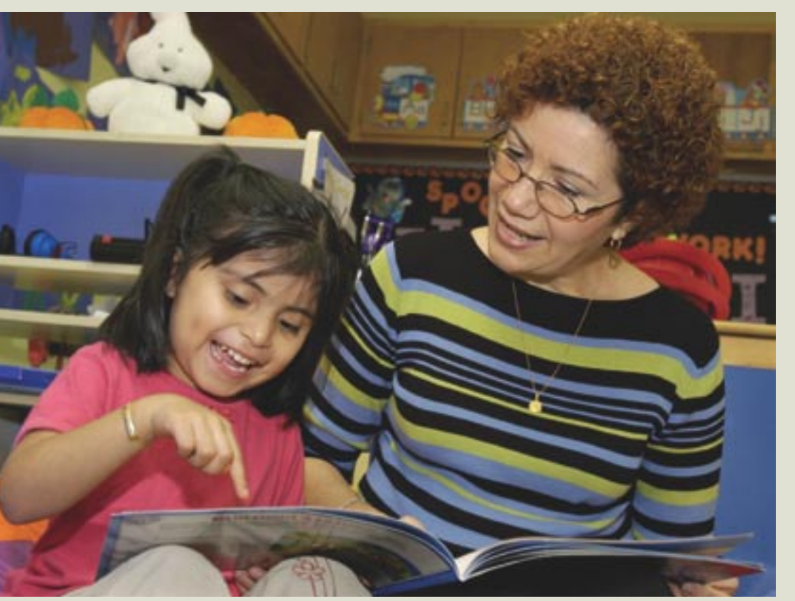
8 early developments | spring 2004

Experts in the field view the preservation of a child's home language as a critical aspect of language development for English language learners. Administrators responding to this survey generally agreed on the importance of this approach. Further, administrators generally agreed with the notion that learning two languages at the same time does not cause confusion or language delays in young children, and that teaching both languages actually facilitates English language learning—findings consistent with recommendations in the literature.