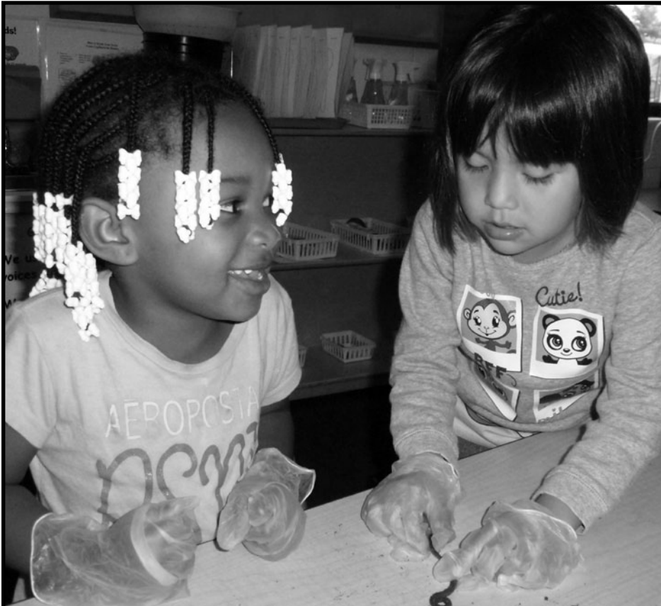
Subjects &amp; Predicates

Some children learn better by listening, others learn better by seeing, still others learn better by doing. Most people, including children, learn best from a combination of all these approaches. The concept that learning is multisensory is built into every appropriate early childhood curriculum.